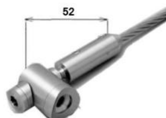
SHA1020 5mm Wire Holder for 42/48/Flat