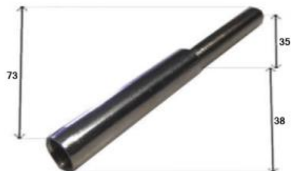
EST1001-316-B-K End Wire Holder for Crimping 5mm Wire 316