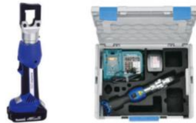
Crimper Hydraulic Battery Crimping Tool (Available for Rent)