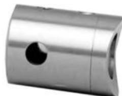
STH2001-6.3 5mm Wire Retainer for 42/48/Flat 304/316