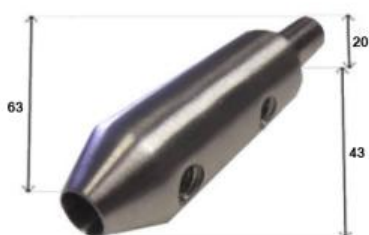
SHA1020-WIREHOLDER Wire Holder x 5mm Wire, with 3 Grub Screws 304