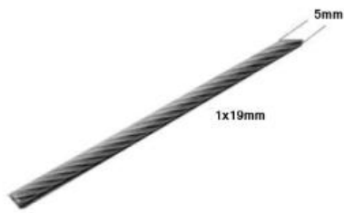
WB-805-316 5mm Wire - 1 x19mm 50m / 100m / 250m Coils 316