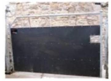
Stokbord used as sheeting for gates