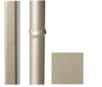
Dorado Gold (GD)