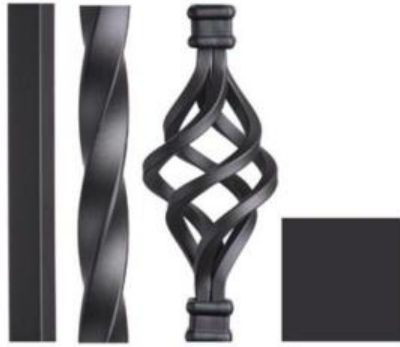
Satin Black (STB)