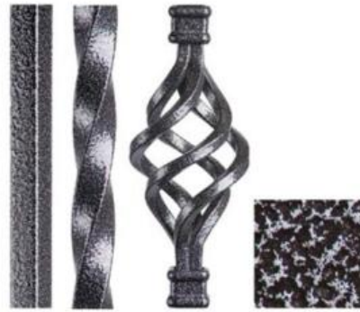
Silver Vein (SP)