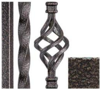
Copper Vein (CV)