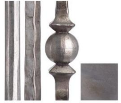
Satin Clear (SC) This is a clear finish over raw/unfinished iron, variations in surface colour may occur