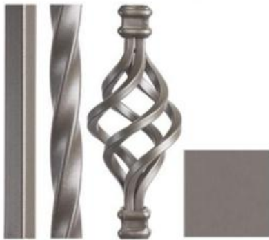
Ash Grey (AG)