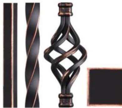
Oil Rubbed Copper (ORC)