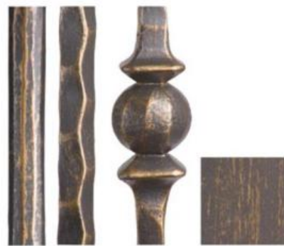
Vintage Brass (VB)