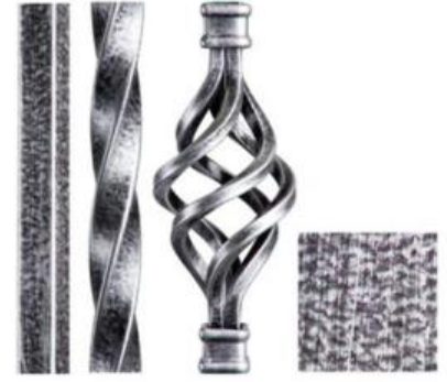
Antique Nickel (AN)