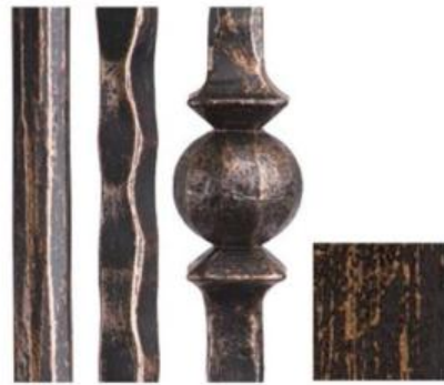
Oil Rubbed Bronze (ORB)