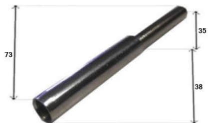
EST1001-316-B-K End Wire Holder for Crimping 5mm Wire 316