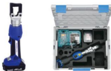
Crimper Hydraulic Battery Crimping Tool (Available for Rent)