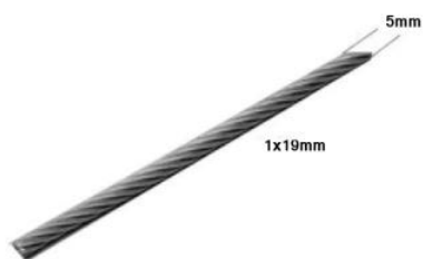
WB-805-316 5mm Wire - 1 x 19mm 50m / 100m / 250m Coils 316