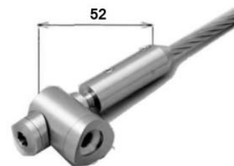
SHA1020 5mm Wire Holder for 42/48/Flat