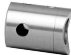
STH2001-6.3 5mm Wire Retainer for 42/48/Flat 304/316