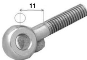
SHA1005 5mm Wire Eye Bolt 316