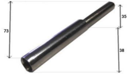
EST1001-316-B-K End Wire Holder for Crimping 5mm Wire 316