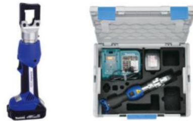
Crimper Hydraulic Battery Crimping Tool (Available for Rent)