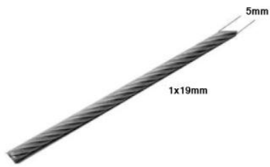
WB-805-316 5mm Wire - 1 x19mm 50m / 100m / 250m Coils 316