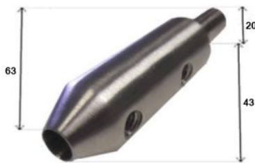
SHA1020-WIREHOLDER Wire Holder x 5mm Wire, with 3 Grub Screws 304